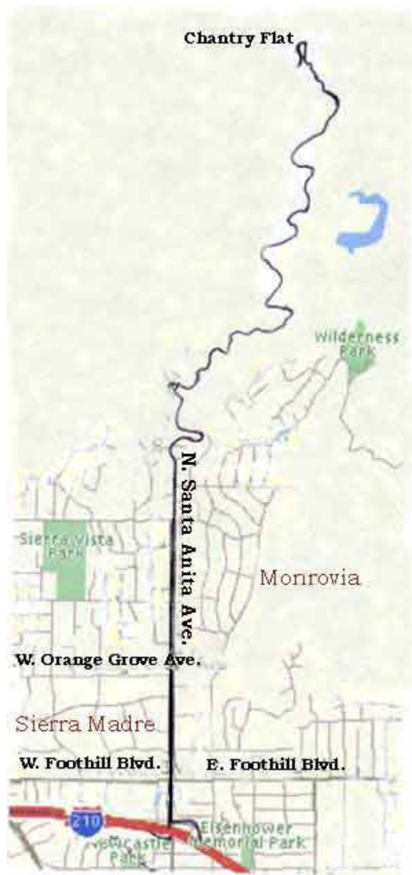
Map to Trail head: